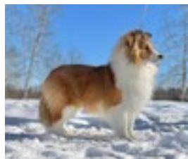
Can Ch Zesta Time To Shine