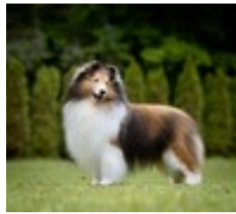
NBISS Am GCHS Can GCH Laureate Invincible CGN ROM ROMC