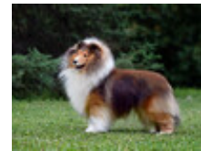
Am Can Ch Laureate Macadamia ROM ROMC