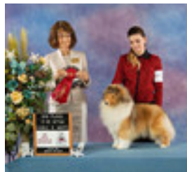
Am Ch Can GCH Laureate K Syrah Syrah