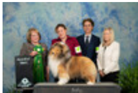
Am GCH Can Ch Laureate Magnified ROM ROMC