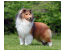
Can Ch Laureate Invictus