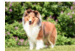
Can Ch Zesta Get Yer Shine On