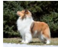
Am Can Ch Laureate Immortality ROMC