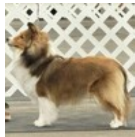
Can Ch Zesta Star In The Skye