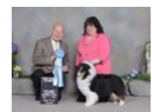
Am Can GCH Zesta Hello Forever ROMC