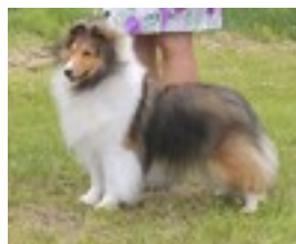
Can Ch Zesta Intensified