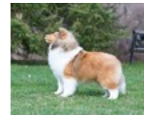
Am Can Ch Laureate Red Red Wine ROM ROMC