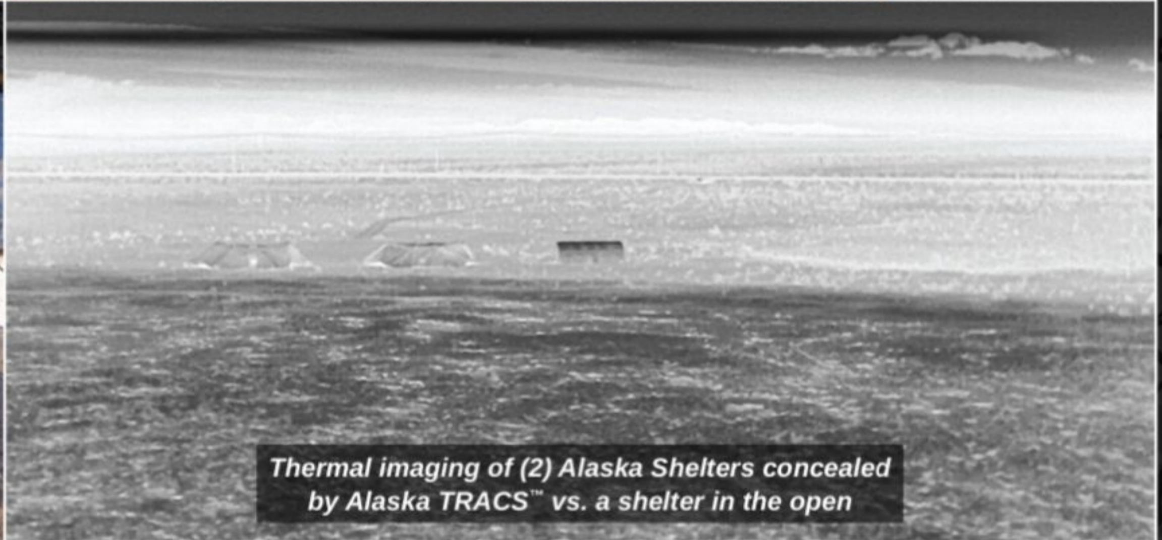
Thermal imaging of (2) Alaska Shelters concealed by Alaska TRACS™ vs. a shelter in the open