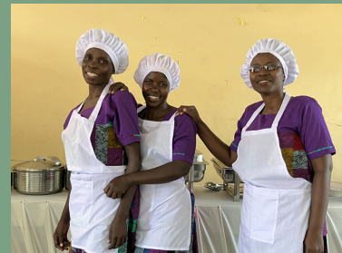
READY FOR SERVICE