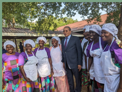
REHEMA LADIES (IN PURPLE)