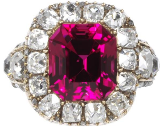
A 'Spinel Ruby' and 'Diamond' ring, circa 1840. 7