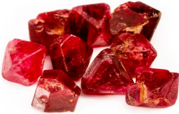
The octahedral and macle forms of 'Spinel Ruby'. 1

The credit for the first identification of 'Spinel' is commonly given to Jean-Baptiste Louis de Romé de L'Isle. Within his 1783 work Crystallography , De Romé de L'Isle identified 'Spinel Ruby' through its octahedral and macle forms. But is this credit warranted? After all, today's gemmologists would be ill-advised to rely on crystal form alone.