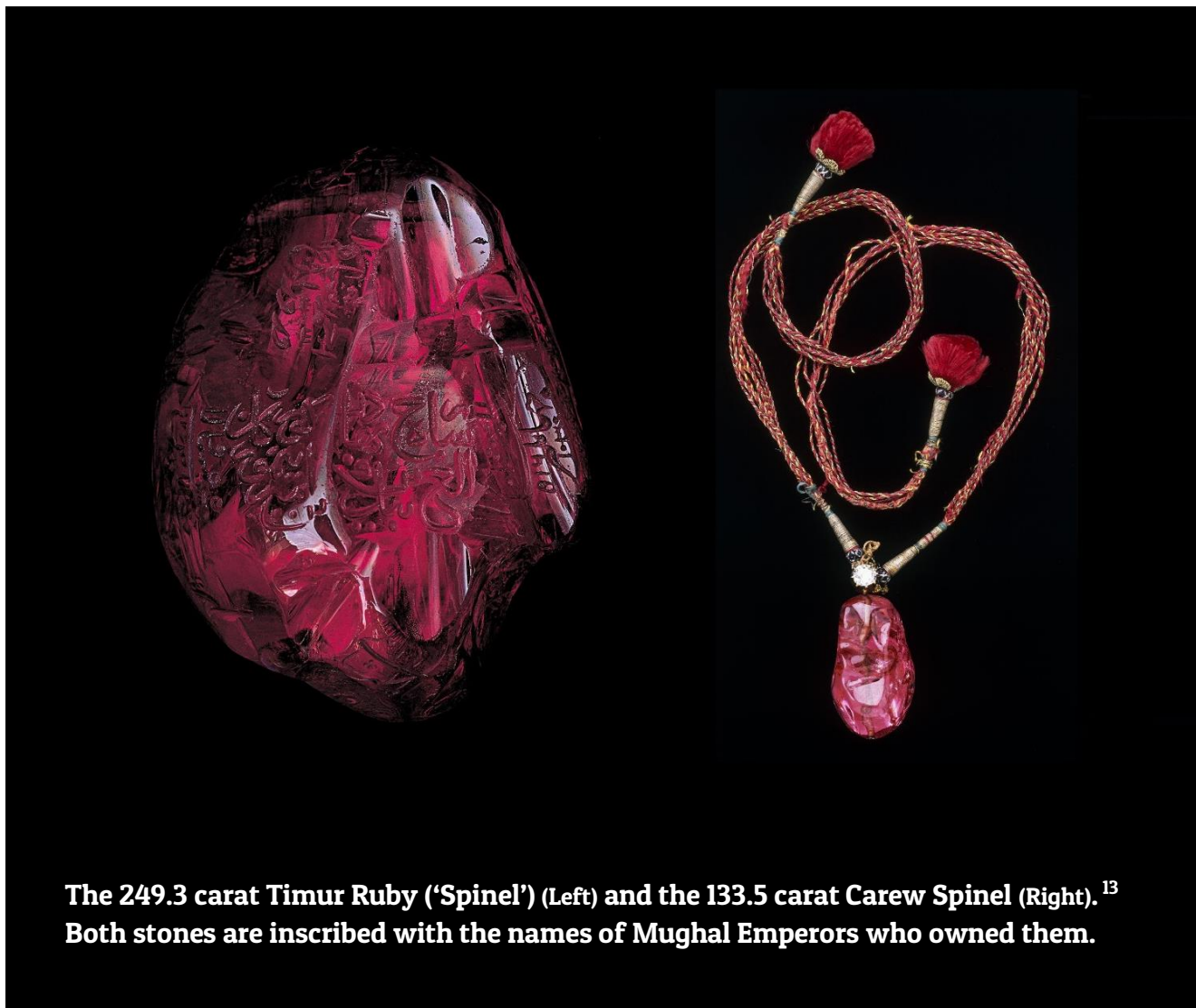
The 249.3 carat Timur Ruby ('Spinel') (Left) and the 133.5 carat Carew Spinel (Right). 13 Both stones are inscribed with the names of Mughal Emperors who owned them.

So, does De Romé de L'Isle deserve the credit for the first identification of 'Spinel'? By focussing on its octahedral form, he had identified a property of 'Spinel' which – though not always useful – was unique among the red gemstones then known. 11 But he was not the first! Unbeknownst to him, the Arab scholar Abū al-Rayhān Al-Berūnī had already employed a specific gravity flask to obtain an accurate measure of the stone's density. It is therefore Al-Berūnī who should be credited with the first identification of 'Spinel', which he achieved by the year 1035! (Al-Berūnī, prior to 1035, p.66). 12