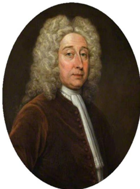
Portrait of John Woodward. 9

A modern gemmologist would likely agree on Woodward's points 1, 2 and 4: that the incorporation of metallic elements can affect a crystal's specific gravity, hardness, and especially colour. Point 3 is less obvious. On a superficial level, it is indeed the colouring element of 'Ruby' (Chromium) that governs its typically tabular form (compared to the bipyramid form of 'Sapphire'). But more profoundly, Woodward is suggesting a crystal arising from a mixture of 'Quartz' ( \text{SiO}_2 ) and a "metallic Matter" (e.g. Zirconium, Zr) may present a changed form. In this example, the gemmologist might reasonably expect a tetragonal prism of 'Zircon' to be produced ( \text{ZrSiO}_4 ), rather than a hexagonal prism of 'Quartz'.