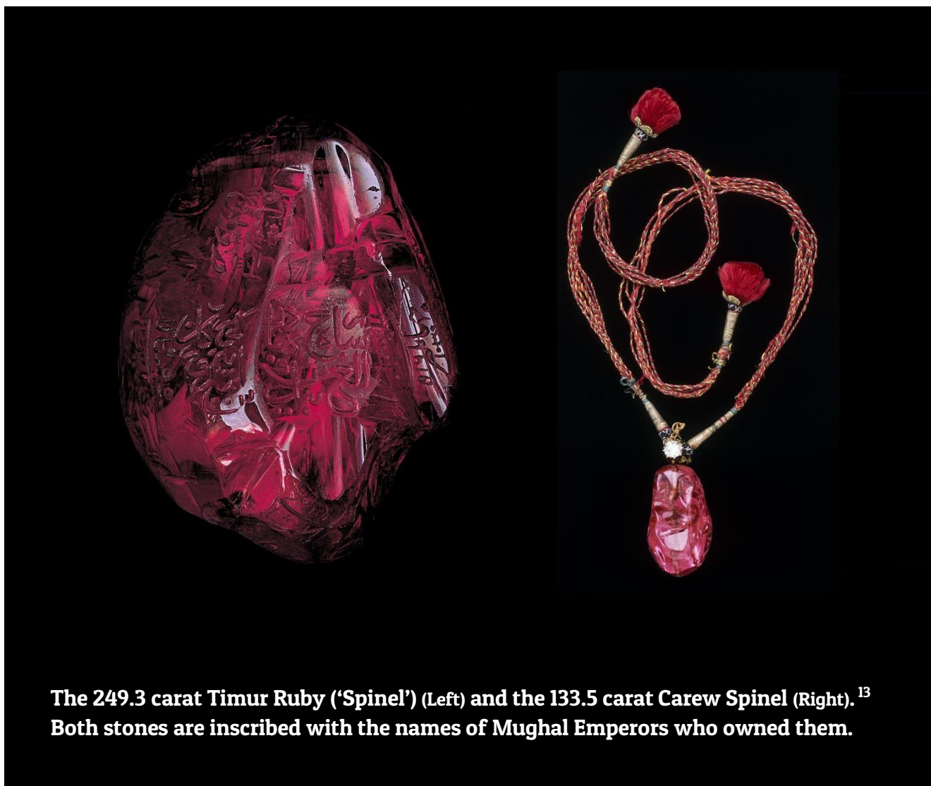
The 249.3 carat Timur Ruby ('Spinel') (Left) and the 133.5 carat Carew Spinel (Right). 13 Both stones are inscribed with the names of Mughal Emperors who owned them.

So, does De Romé de L'Isle deserve the credit for the first identification of 'Spinel'? By focussing on its octahedral form, he had identified a property of 'Spinel' which – though not always useful – was unique among the red gemstones then known. 11 But he was not the first! Unbeknownst to him, the Arab scholar Abū Rayhān al-Birūnī had already employed a specific gravity flask to obtain an accurate measure of the stone's density. It is therefore al-Birūnī who should be credited with the first identification of 'Spinel', which he achieved by the year 1035! (Al-Birūnī, prior to 1035, p.66). 12