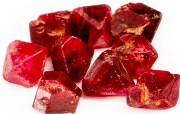
The octahedral and macle forms of 'Spinel Ruby'. 1

The credit for the first identification of 'Spinel' is commonly given to Jean-Baptiste Louis de Romé de L'Isle. Within his 1783 work Crystallography , De Romé de L'Isle identified 'Spinel Ruby' through its octahedral and macle forms. But is this credit warranted? After all, today's gemmologists would be ill-advised to rely on crystal form alone.