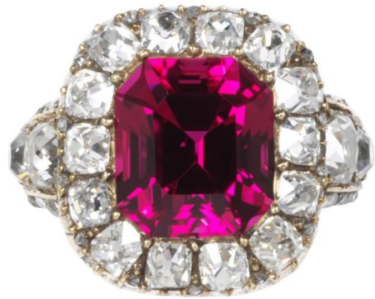
A 'Spinel Ruby' and 'Diamond' ring, circa 1840. 7

What was required was a categorical method of distinguishing 'Spinel Ruby' from the other varieties. The person who came closest to this, at least within the Western scientific tradition, was John Woodward. In 1728 Woodward rejected the convention of naming gemstones according to colour. This, he considered, was the cause of the ' Confusion that we find among the writers of Gemms, both Antient and Modern ' (Woodward, 1728, p.27). In its place, Woodward outlined a new theory on the formation and composition of crystals: