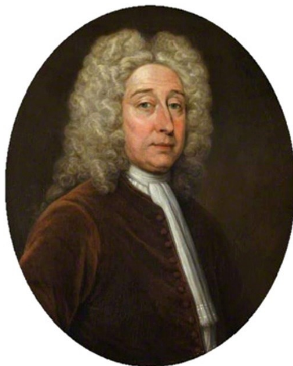
Portrait of John Woodward. 9

A modern gemmologist would likely agree on Woodward's points 1, 2 and 4: that the incorporation of metallic elements can affect a crystal's specific gravity, hardness, and especially colour. Point 3 is less obvious. On a superficial level, it is indeed the colouring element of 'Ruby' (Chromium) that governs its typically tabular form (compared to the bipyramid form of 'Sapphire'). But more profoundly, Woodward is suggesting a crystal arising from a mixture of 'Quartz' ( \text{SiO}_2 ) and a "metallic Matter" (e.g. Zirconium, Zr) may present a changed form. In this example, the gemmologist might reasonably expect a tetragonal prism of 'Zircon' to be produced ( \text{ZrSiO}_4 ), rather than a hexagonal prism of 'Quartz'.