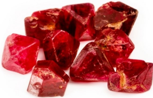
The octahedral and macle forms of 'Spinel Ruby'. 1

The credit for the first identification of 'Spinel' is commonly given to Jean-Baptiste Louis Romé de l'Isle. Within his 1783 work Cristallographie , Romé de l'Isle identified 'Spinel Ruby' through its octahedral and macle forms. But is this credit warranted? After all, gemmologists would be ill-advised to rely on crystal form alone.