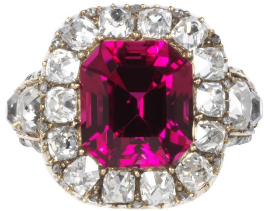
A 'Spinel Ruby' and 'Diamond' ring, circa 1840. 7

What was required was a categorical method of distinguishing 'Spinel Ruby' from the other varieties of 'Ruby'. The person who came closest to this, at least within the Western scientific tradition, was John Woodward. In 1728 Woodward rejected the convention of naming gems according to colour. This, he considered, was the cause of the ' Confusion that we find among the writers of Gemms, both Antient and Modern ' (Woodward, 1728, p.27). In its place, Woodward outlined a new theory on the formation and composition of crystals: