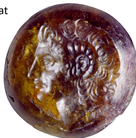
A yellow-red tourmaline intaglio depicting the head of Alexander the Great, 4C BCE. 7