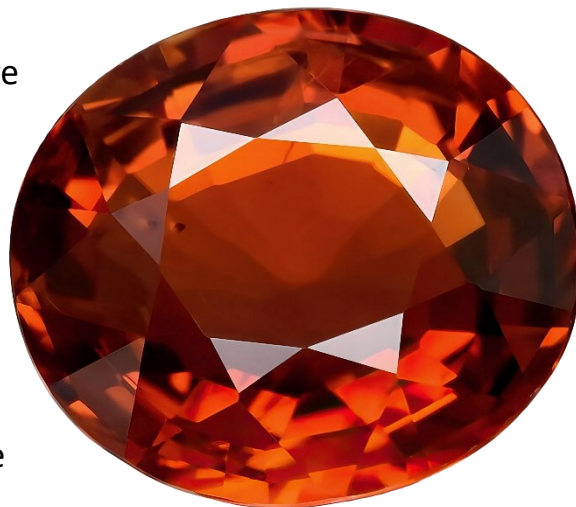
A faceted tourmaline. 4

The discovery of tourmaline's pyroelectric nature was reportedly made by the children of Dutch merchants whilst playing with their parents' gems. More likely it was the parents who made the discovery whilst attempting a heat treatment of the stones (Zara, 1973, p.33). In any case, when we consider that the Dutch only exported cut stones from Ceylon (Müller, 1780, p.183), the case for Tourmaline being discovered as a cut stone becomes clear.