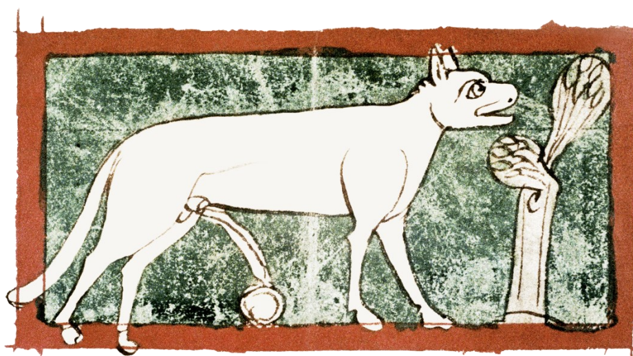
A lynx in the process of creating a lyngourion (tourmaline).