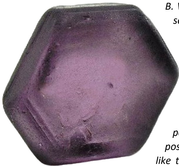
A rough taaffeite crystal. 2

Facets were scarcely visible in methylene iodide, so I gathered that the refractive index was near spinel. [...] But the double refraction! I checked it with crossed nicols [i.e. a polariscope] and got normal extinction at 90 degrees. I became puzzled. I could see no bands in the spectrum. [...] I panicked, sent the stone to B. W. Anderson at the Laboratory of the London Chamber of Commerce, and begged for help. I wrote on November 1 1945: 'This time a new riddle: what is this mauve stone? It seems to me to answer all characteristics of spinel, yet it shows double refraction: doubling of facets visible under the Greenough [microscope], extinction when polarized, though with queer colour effects. Could anomalous double refraction be so strong? R.I. too high for topaz, S.G. too low for corundum. What is it?'