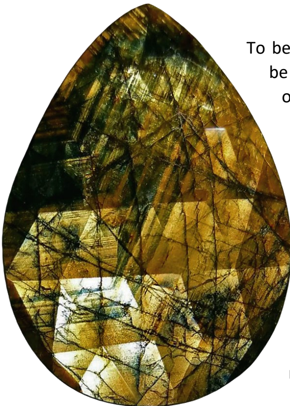
'Golden Sheen Sapphire' 4

To be eligible for trademark protection a name must be distinctive (and not merely descriptive). Thus, the owners of the 'Royal Blue' trademark ( Perfect Luck Assets Limited ) would likely struggle to prevent its use as a description of 'Sapphire'. And the same is true for Genuine Gems & Jewellery Co ; owners of 'Gold Sheen'.