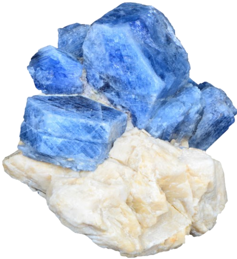
'Blue Ruby' 1

The 21 st century has brought immense pressure for the jewellery industry: with greater competition from online retailers; with created gemstones eroding margins; and with growing scrutiny of the industry's environmental impact. In this context, it is no surprise that trading rules are in the spotlight. This Bulletin considers three issues for gem marketing: colour varieties; trademarks; and created vs natural gemstones.