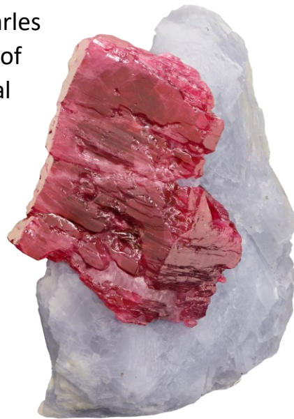
'Red Ruby' 1

From this point, the distinction between 'Ruby' and 'Sapphire' became scientifically obsolete, making the name 'Blue Ruby' equally as valid as 'Yellow Sapphire', and equally unlikely to mislead.