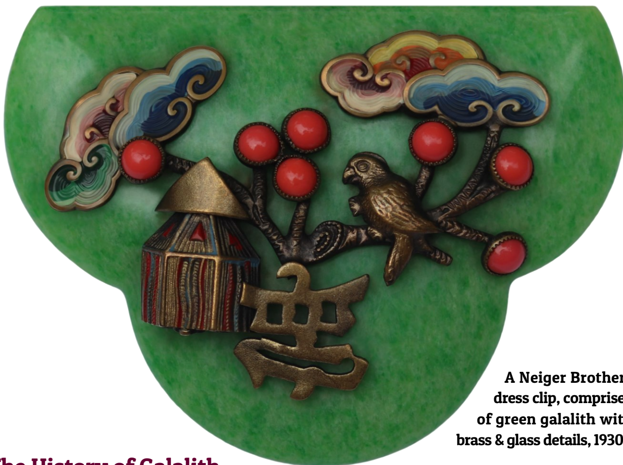
A Neiger Brothers dress clip, comprised of green galalith with brass & glass details, 1930s.

Named from the Ancient Greek 'gala' (milk) and 'lithos' (stone), this versatile gemstone is conspicuous by its absence from modern jewellery.