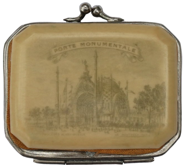
A galalith purse from the Paris World Fair (with a lithographic image by Alary-Ruelle). The product's wonky dimensions reflect a material in the early stages of development.

Galalith should not be confused with modern "breast milk jewellery", which consists of powdered milk suspended in epoxy. The predominant ingredient of genuine galalith is casein, which forms roughly 80% of the protein in cow's milk (human milk has a greater proportion of whey protein). Splitting milk's casein curd from its watery whey is a familiar process to cooks. But rather than use a weak acid such as lemon juice or vinegar, Krische and Spitteler employed lead acetate (a toxic salt used by Ancient Romans as a sweetener). The remainder of their method is described in a patent application as follows: