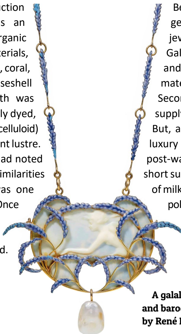
A galalith, enamel, gold and baroque pearl necklace, by René Lalique, circa 1905. 4

Being well-suited to the bold, geometric forms of Art Deco jewellery, the popularity of Galalith peaked in the 1920s and 30s. Production of the material continued during the Second World War in order to supply buttons for the military. But, as the war concluded, the luxury of Art Deco gave way to post-war austerity. Food was in short supply. And, whilst the value of milk increased, the adoption of polyester drove down the price and prestige of plastics. The era of galalith jewellery had ended.