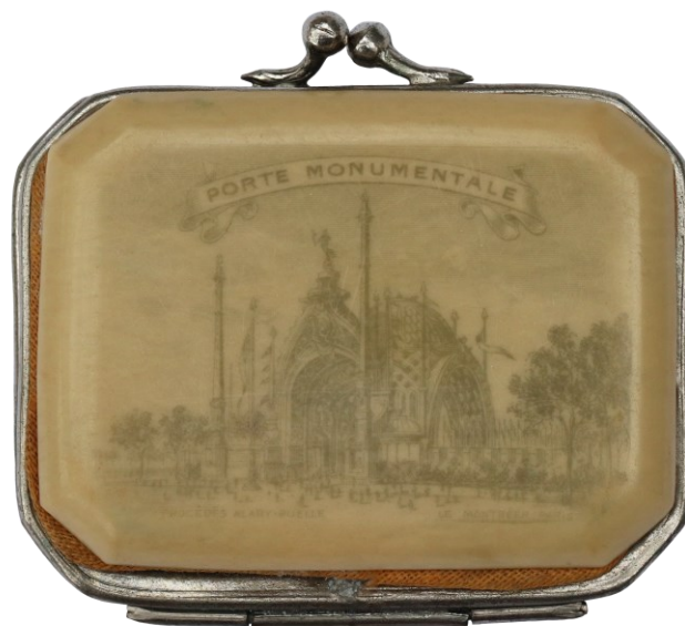
A galalith purse from the Paris World Fair (with a lithographic image by Alary-Ruelle). The product's wonky dimensions reflect a material in the early stages of development.

One of the first designers to see the potential of galalith for jewellery was the French merchant Auguste Bonaz, who began creating brooches made of the new material inspired by the Bauhaus style in the early 1920s. This trend eventually caught fire when, in 1926, Coco Chanel published a picture of the now-iconic little black dress in Vogue magazine and accessorized it with costume jewellery made of galalith. The German designer Jakob Bengel [then] elevated costume jewellery and other plastics from fake to chic with his creative, sensitive products and a high level of workmanship. (Knol, 2016)