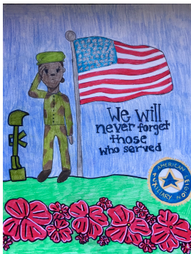
1 st prize poster by Raychel Fimmano

The contest begins at local ALA units. We are pleased to announce the following winners of the American Legion Auxiliary Adolph Pfister Unit 1038 Poppy Poster Contest: