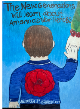
1 st prize poster by Raychel Fimmano