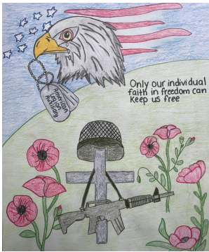
1 st prize poster by Katie Chong

The contest begins at local ALA units. We are pleased to announce the following winners of the American Legion Auxiliary Adolph Pfister Unit 1038 Poppy Poster Contest: