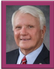
Speaker of the House