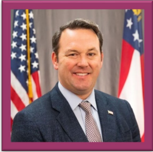
Senate President Lt. Governor