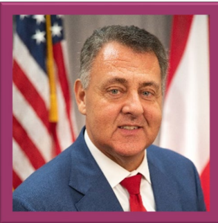
Majority Leader 51st District