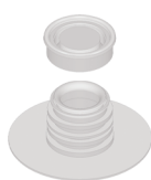
VALVE ASEPTIC FILL