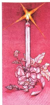
My Advent Offering

MONTH OF THE HOLY SOULS: Throughout the month of November there will be masses in commemoration of All Souls and the persons you have named will be prayed for in our petitions.