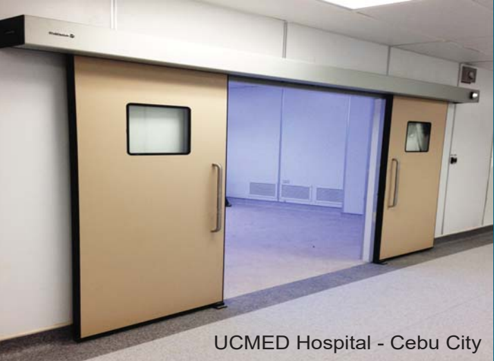
UCMED Hospital - Cebu City