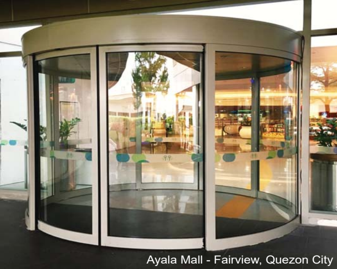
Ayala Mall - Fairview, Quezon City