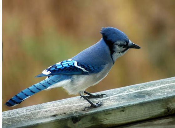
Blue Jay on a fence.

The Blue Jay is a beautiful blue bird that lives in both forests and urban areas as well as in the Garden City Bird Sanctuary. Though often given a bad reputation because of their aggressiveness, they are really intelligent creatures capable of forming tight family bonds with other blue jays.