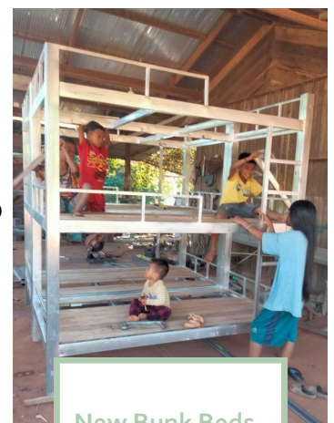
New Bunk Beds