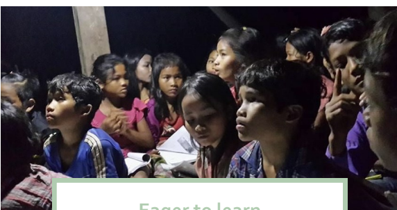
Eager to learn

“No more dawn departures from their village to race for the ferry. No more burning through the family's meager finances for motorbike fuel. No more being reduced to tears from the stress of the commute, and the scolding of parents who say, 'the commute is too expensive, we can't afford it, you are impoverishing the family, just drop out....”