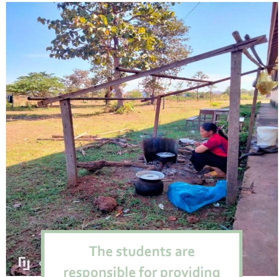
The students are responsible for providing and cooking there own