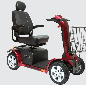
VICTORY® 10.2 3 & 4-wheel scooter