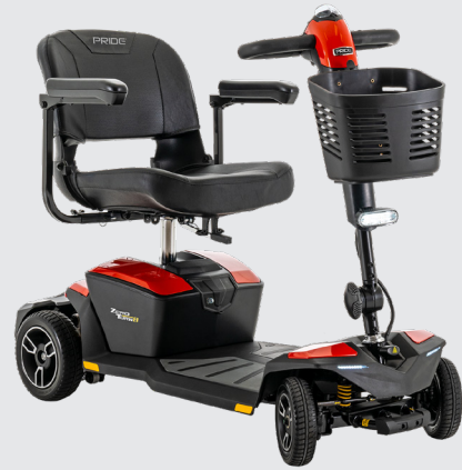
ZERO TURN 8 4-wheel scooter