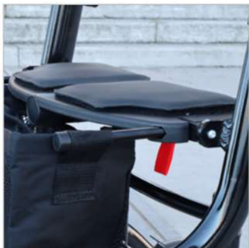
Foam Cushioned Pads/ Coussinets en mousse Part. no 90232