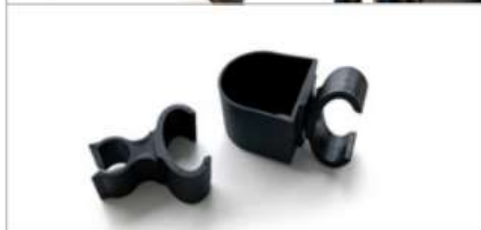
Cane/Umbrella Holder/ Support pour canne ou parapluie Part no. 90230