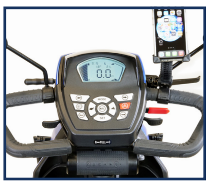
Control panel with LCD screen, cell phone holder, and Bluetooth sound bar