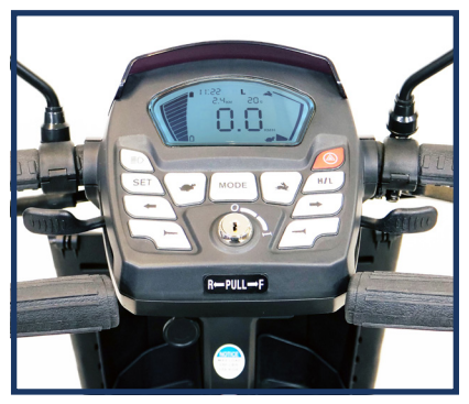
Control panel with LCD screen