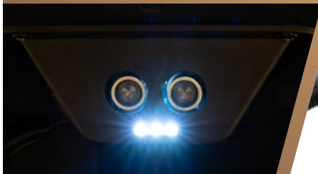
Backup sensor with LED lights