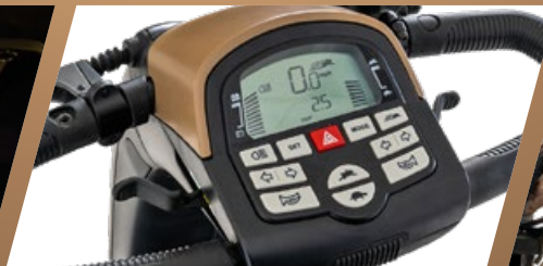
User friendly console