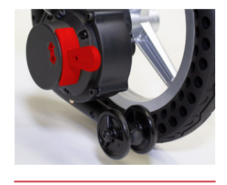
When powered off, freewheel (push) mode can be utilized and the wheels turn freely