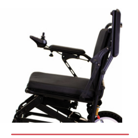
Flip up arm rests for a barrier-free side entry