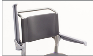
Flip-up arm supports – aids in transfers