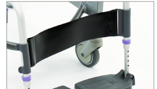
Snap-on Infection Control Calf Strap – dries quickly