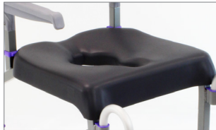
Soft seat overlay – molded / contoured foam for added pressure distribution, comfort and positioning