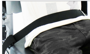
Pelvic belt – side-release buckle ( standard webbing or infection control material )