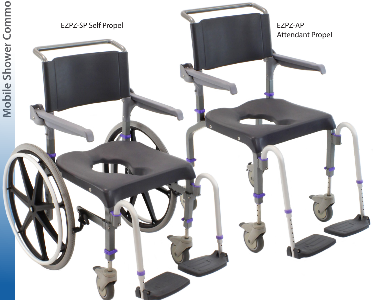
EZPZ-SP Self Propel