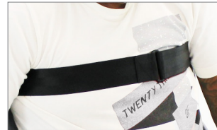
Chest belt – 1-piece with side-release buckle ( standard webbing or infection control material )