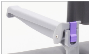
Arm support locks – provide more security during transfers