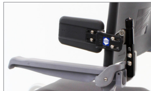
Swing-away laterals – provide lateral trunk support