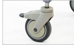
Dual-locking casters (swivel and roll) – stabilizes chair for toileting, bathing and transfers