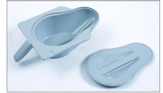
Commode pan with lid – includes anti-splash baffle and high-gloss surface to ease cleaning