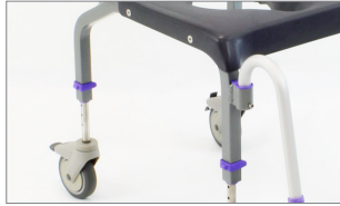
Corrosion-resistant aluminum frame with tool-less height adjustment