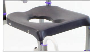
Ergonomically contoured seat for best-in-class comfort