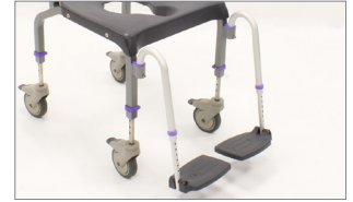
Swing-away, removable foot supports – facilitates transfers