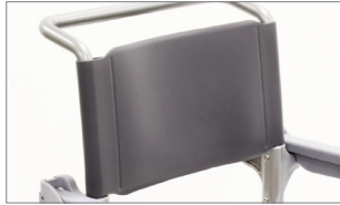
Soft and flexible back support – comfortable and easy to clean