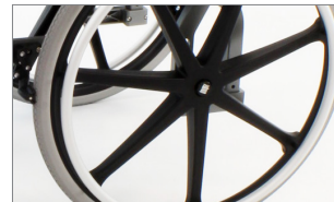
Quick-release axles (EZPZ-SP) – makes transporting the chair easier