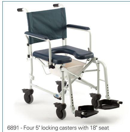
6891 - Four 5" locking casters with 18" seat