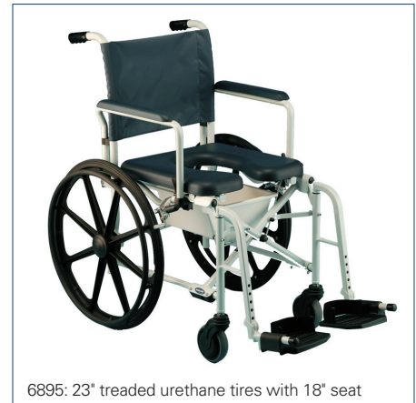
6895: 23" treaded urethane tires with 18" seat