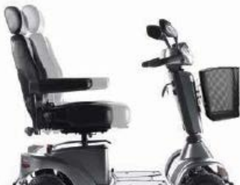
→ Infinite seat depth adjustment