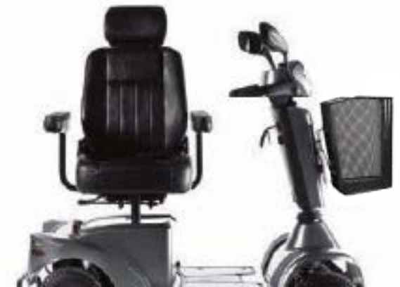
→ Seat rotation enables comfortable transfers