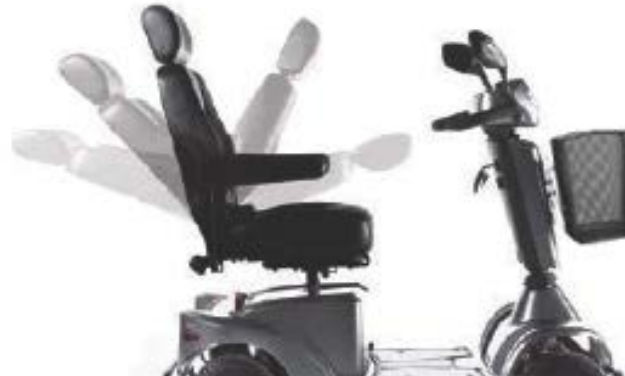
→ Quick backrest angle adjustment