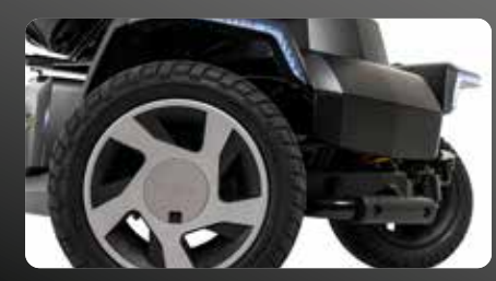
Pride's patent-pending, intelligent-turning, iTurn Technology™ provides 4-wheel stability with 3-wheel maneuverability

With contemporary styling and cutting-edge technology, the Zero Turn 10 is the perfect combination of aggressive performance and maneuverability. Powerful dual motors and two-wheel drive offers aggressive traction, easily tackling rugged terrain on trails. When you're done spending time outdoors, the Zero Turn 10 transitions seamlessly indoors. Maneuver smoothly through the halls and doorways with iTurn Technology™.