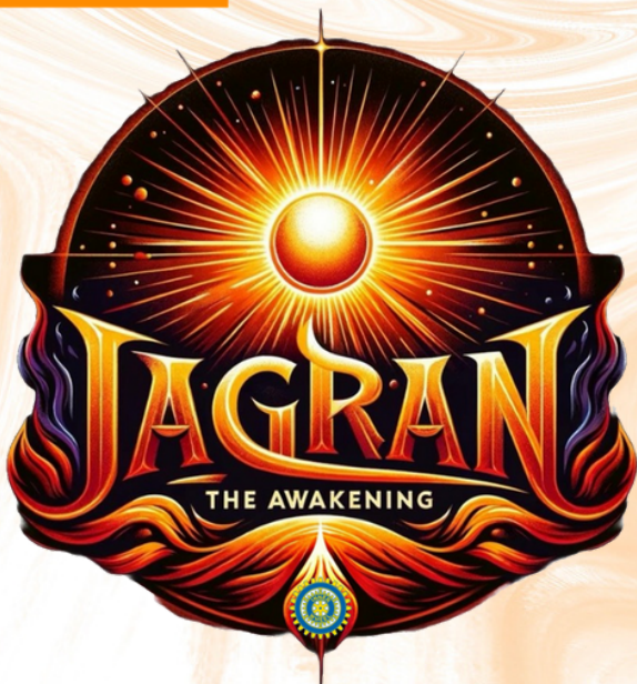
Jagran Assembly Team