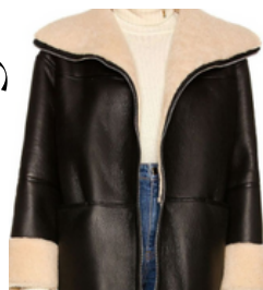
Toteme Signature Shearling Jacket $2,320 at Forward