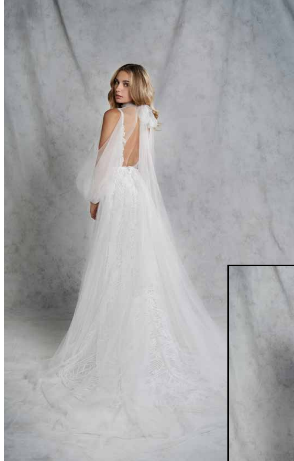
NOVA STYLE 12213 | 12213_DRO