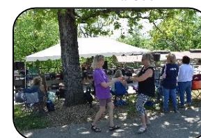
Enjoying the show!