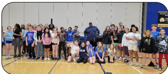
Thomas Jefferson 6 th grade class..