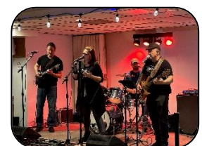
Eagles - host Better Than Bad