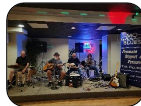
Eagles - host Diddy Wah Daddies