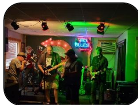
The Outpost - host GrajMahal

MO Blues scheduled nine jam sessions throughout the year hosted by various member bands. These commenced in February with a jam at the Outpost with GrajMahal as the host band, Other locations hosting jams were the Eagles , Prison Brews , the Mission , the Eagles in Columbia , & Serenity Valley Winery . The monthly jams are a good way to encourage folks to get personally involved in living the blues.