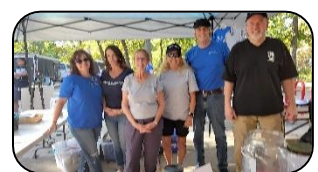
MO Blues Board & Volunteers

*Visit our website at www.moblues.org , our Facebook at https://www.facebook.com/mobluesmissouri , or email us at PO Box 105758, Jefferson City, MO 65110