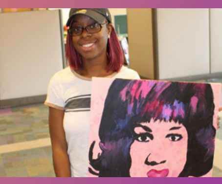
Therapeutic Arts Program Annual Art Show and Silent Auction