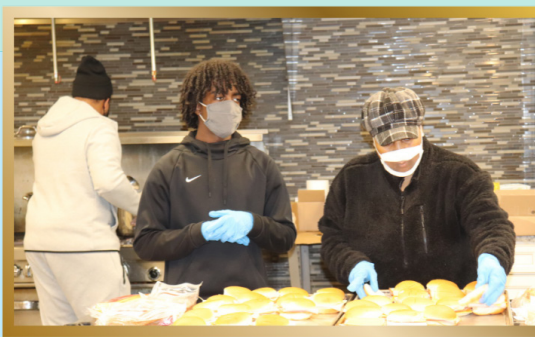
On January 16, members of the Simba and Malaika mentoring programs held a day of service at the Ronald McDonald House.