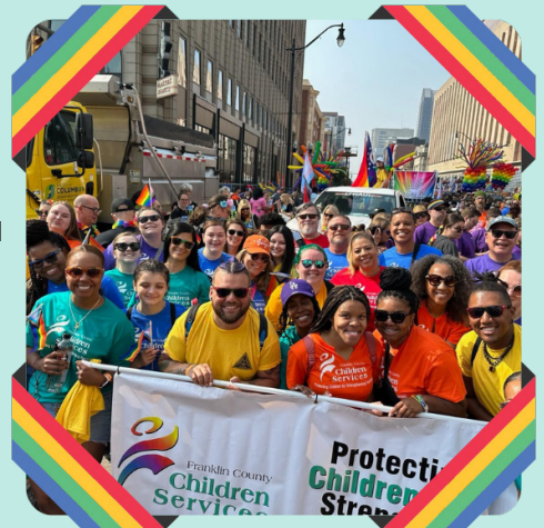
FCCS staff and volunteers marched in the Stonewall Columbus Pride Parade on June 15.