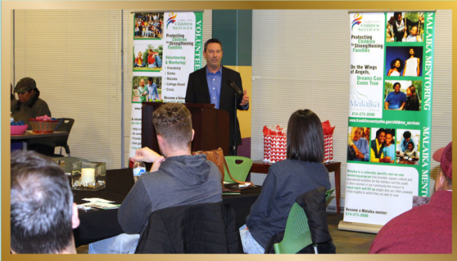
On January 25, community members came out to learn about the agency's volunteer and mentor programs during Make a Difference Night.

Franklin County Children Services has asked community members and organizations to partner with us in celebrating and offering opportunities to the youth and families we serve. FCCS staff and volunteers have given back in turn.