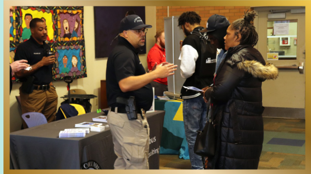
On March 18, youth involved with the agency attended a Career Fair during which they learned about education and employment opportunities.