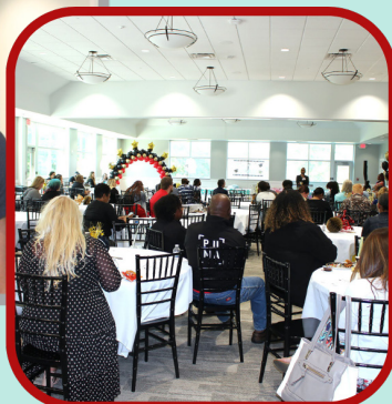
The annual Child Abuse Prevention Breakfast was held April 13 at the Grand Event Center. During the event, youth, families, staff, and community partners were recognized for outstanding achievements and scholarships were presented.