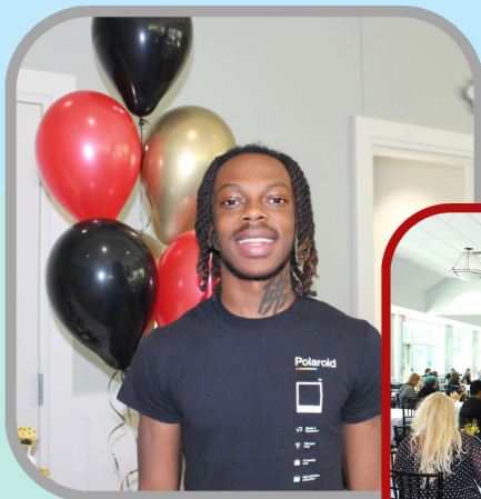
On June 14, FCCS celebrated youth involved with the agency who graduated or earned their GEDs this spring with help from generous donations from the community. The celebration took place at The Gallery at Champions.