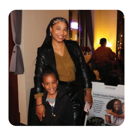
Black Girl Magic Toy Drive