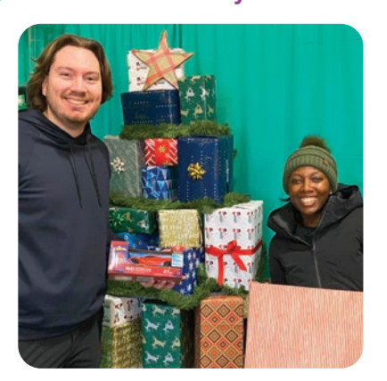
Holiday Wish toy drive donor Lululemon