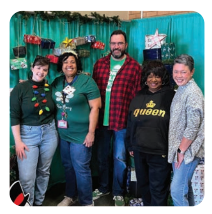
Holiday Wish staff with volunteers from the Ohio Association of Broadcasters