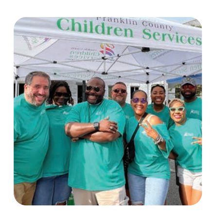
Team FCCS at 2023 African-American Male Wellness Walk