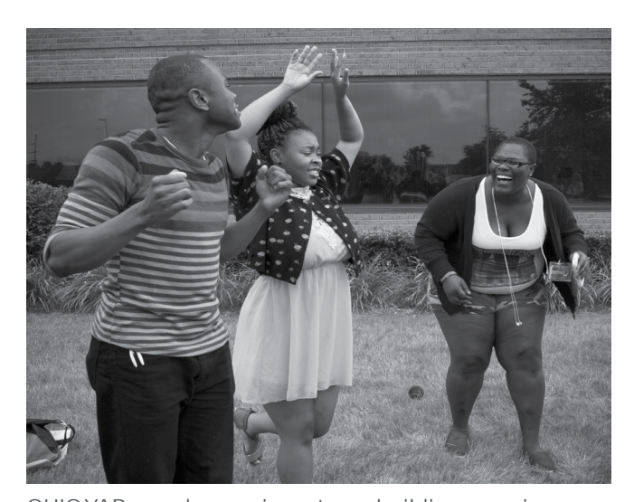
OHIO YAB members enjoy a team-building exercise.

You should have access to the same experiences as your peers; this is called Normalcy. Ask your caseworker what their normalcy policies are. Normalcy policies provide guidance for "normal and beneficial" activities you can participate in, just like youth not in foster care. Be sure to communicate with your caseworker and resource caregiver about your interests and activities you would like to participate in. Your resource caregiver or your agency can approve your participation. There may be times when due to circumstances you are not be able to participate in one of these activities. Talk to your resource caregiver to understand these circumstances.