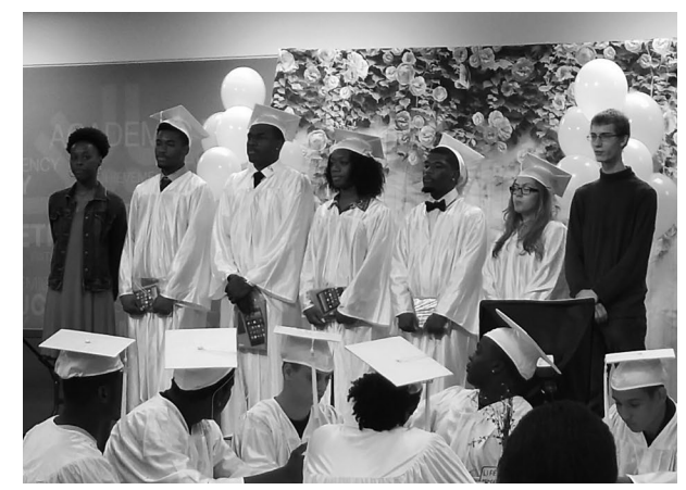
The Cuyahoga County Division of Children and Family Services honored seven graduating seniors who received full academic and room-and-board scholarships to Cleveland State University.