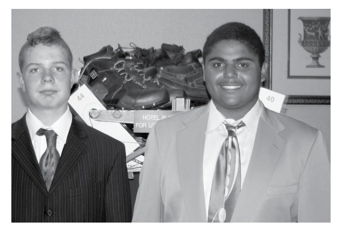
Two youth try on suits in the Suits for Success room at the Fostering Pathways to Success Conference.

When you leave a foster placement, your caseworker will schedule an EXIT INTERVIEW with you. This is a time for you to talk to your caseworker about your experience in your foster home. The interview should happen in private within seven days of your leaving a placement. It cannot be done before you leave the placement, and it cannot include your former foster parents. This interview is very important, as it helps the PCSA improve the experiences of other young people who will someday be placed in that home. Be sure to tell your caseworker everything openly and honestly. If this interview doesn't happen, be sure to ask your caseworker about it.