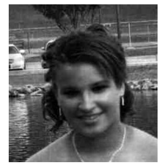
Tricidty, Tuscarawas County

Foster care could be a good support or a bad experience. It all depends on what you make of it. Think or say what you want, but it is a good system if you let it be good.