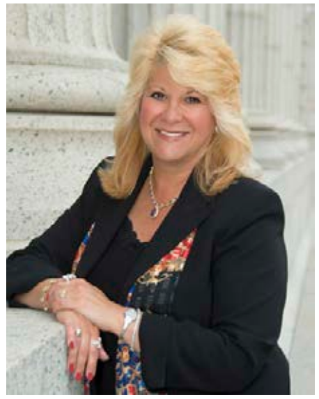
Alumna of the Year