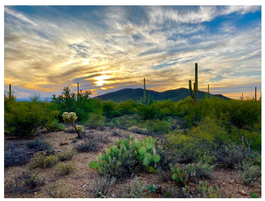
Arizona Southwest Sizzle