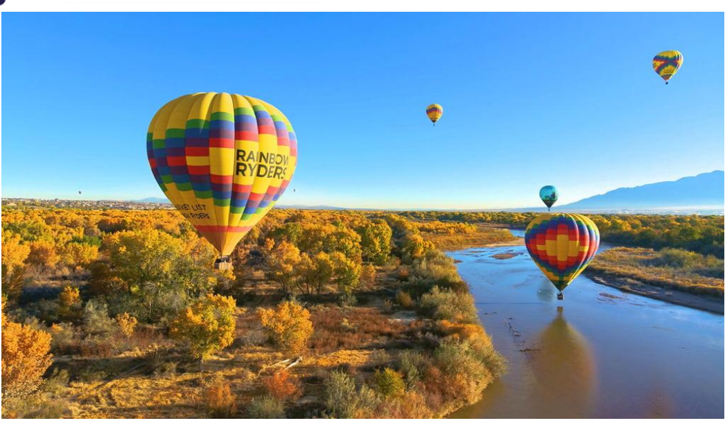
New Mexico to Texas 6 Nights / 7 Days

networking | business building | education | itinerary design | site visits