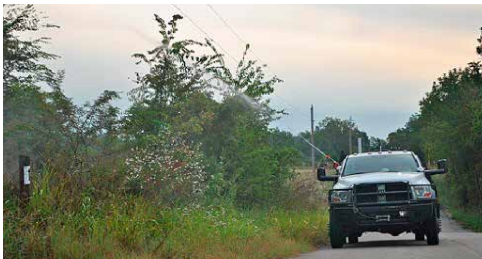
CEC employees spray a stretch of single-phase line northeast of Hugo.