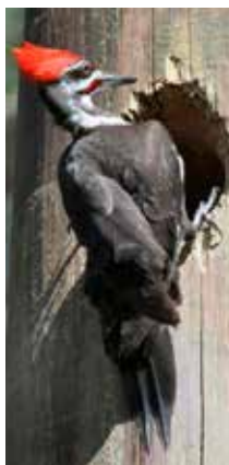
CEC power poles took a beating from woodpeckers over the past year. Most problems occurred near wooded areas near Carter Mountain, Hochatown, Unger and Antlers.

If you notice a damaged electric pole in your area, please notify the co-op immediately at 800-780-6486.