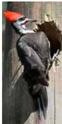
Pileated woodpecker.

CEC power poles took a beating from woodpeckers over the past year. Most problems occurred near wooded areas near Carter Mountain, Hochatown, Unger and Antlers.