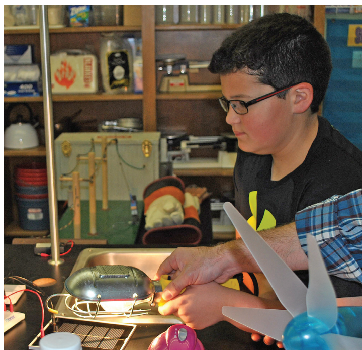
Student at Broken Bow Middle School learns about solar power as part of CEC's free energy education program.

"A field trip is fun because students can visit our dispatch room and see how we track