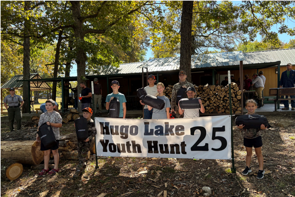
Young hunters are ready for the 27th annual Hugo Lake Youth Deer Hunt, held Oct. 10-12.