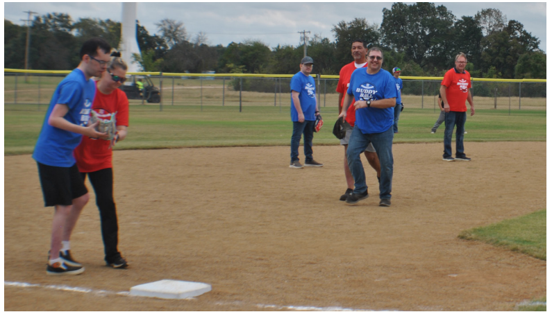
Above: Participants round the bases during the Buddy Ball game on Oct. 18. Below: A Buddy Ball player takes a swing.