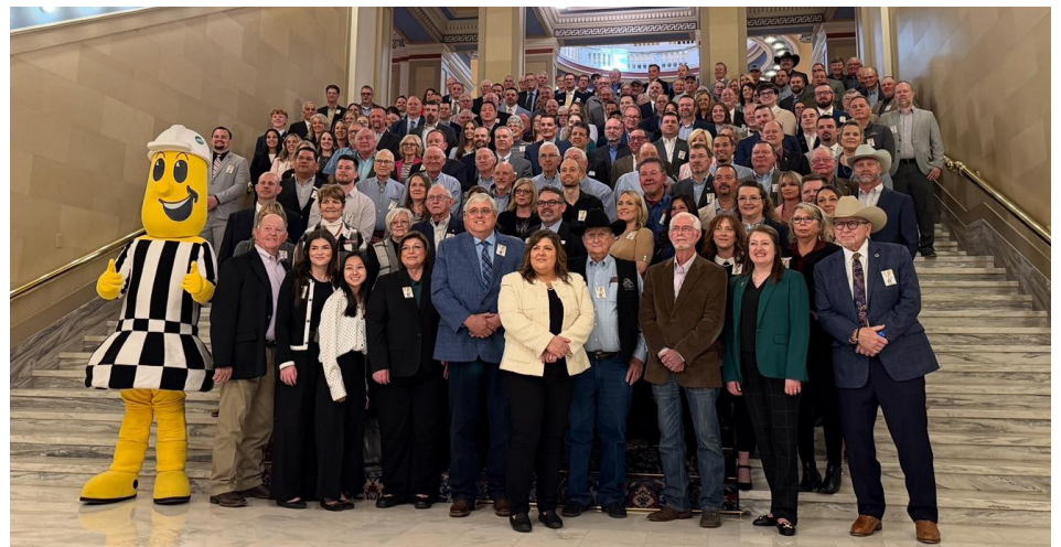
Above: Nearly 200 representatives from Oklahoma's electric cooperatives gathered at the state Capitol on April 7, 2025.