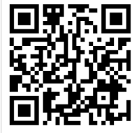
Ways to Give