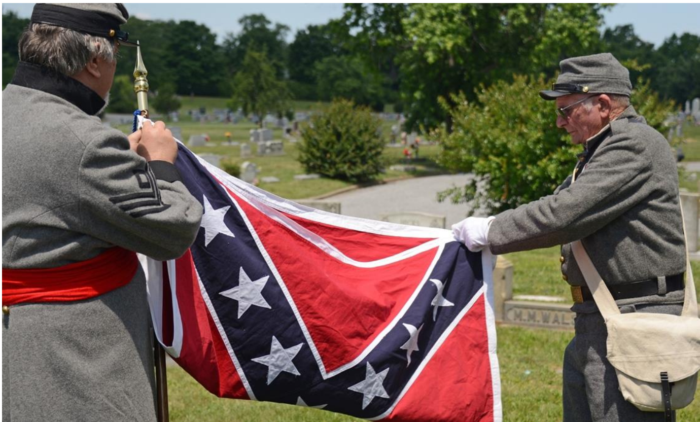
The Captain William Latane SCV Camp 1690 Color Guard folding the banners post-ceremony.