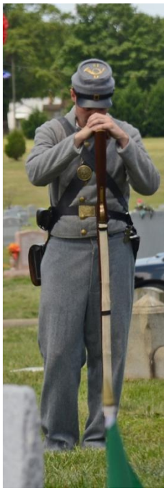
Color Guard Salute