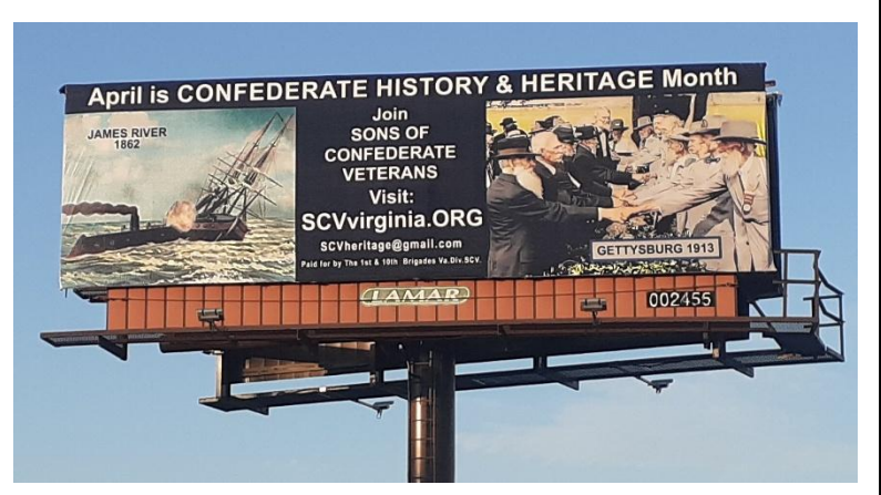
This billboard just went up near the parking lot of the Dock of the Bay Seafood Restaurant.